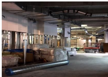
Interior space. Drywall work is scheduled to begin soon over these “roughed-in” areas.